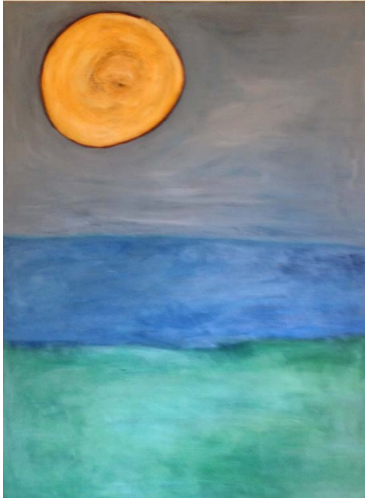
SPRING 48" X 36" OIL ON CANVAS $2,500