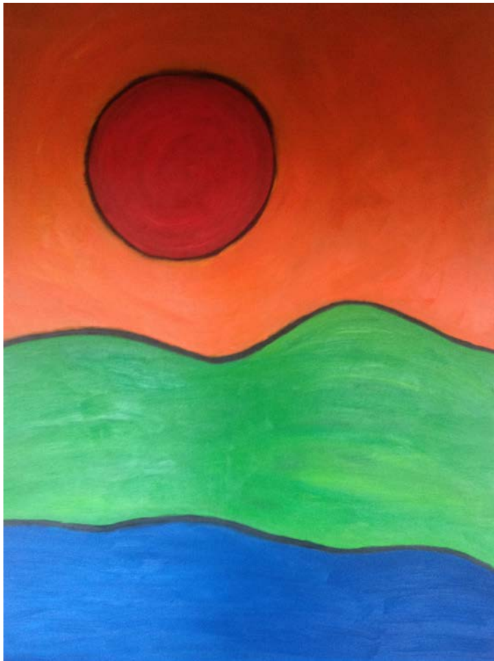
FALL 48" X 36" OIL ON CANVAS $2,500