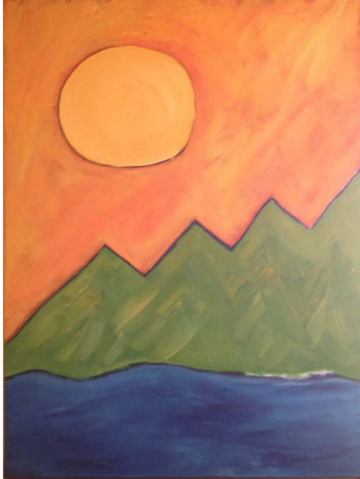
SUMMER 48" X 36" OIL ON CANVAS $2,500