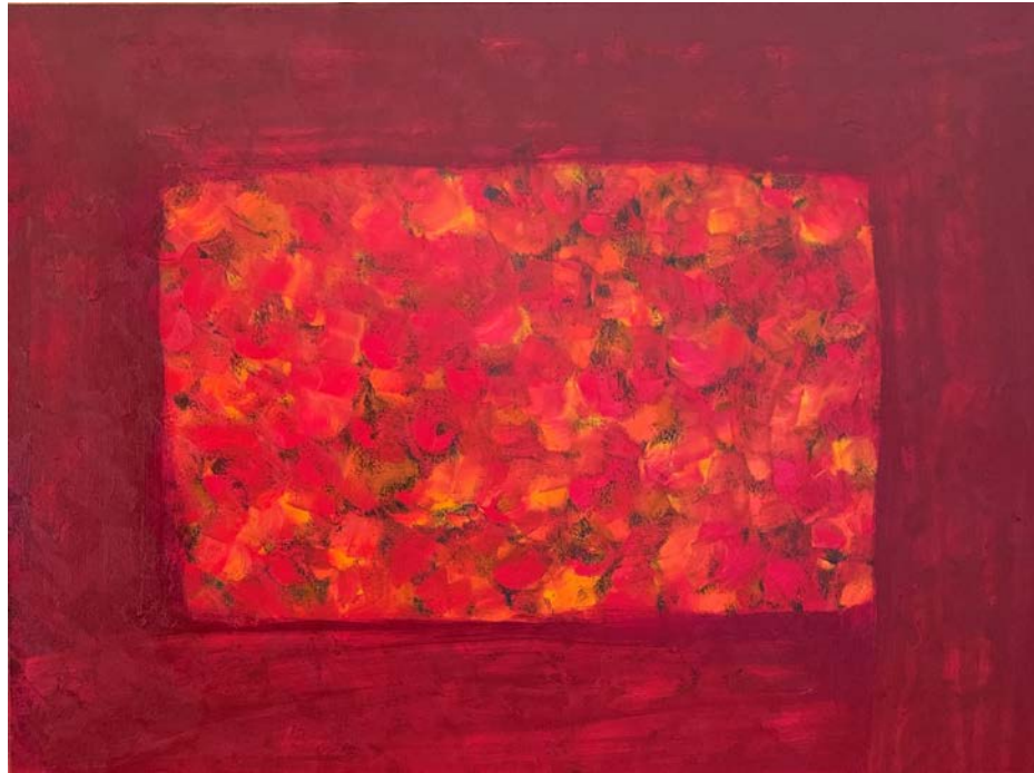
FLOWERS 30" X 40" OIL ON CANVAS $1,000