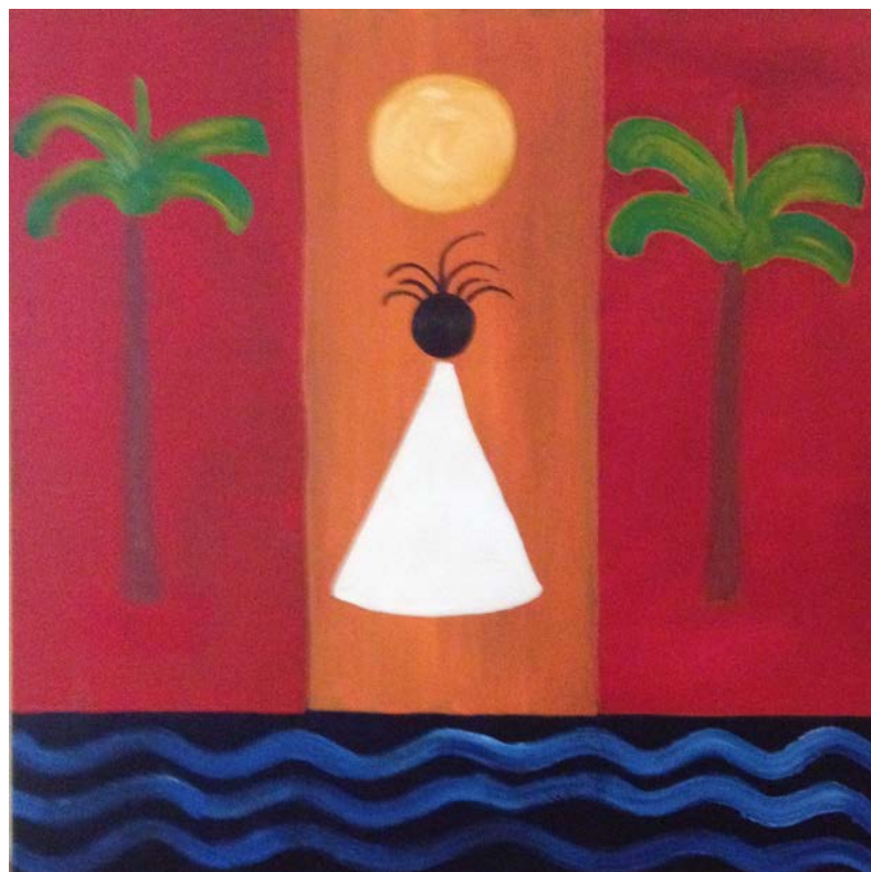
CUBAN DOLL 36" X 36" OIL ON CANVAS $2,000