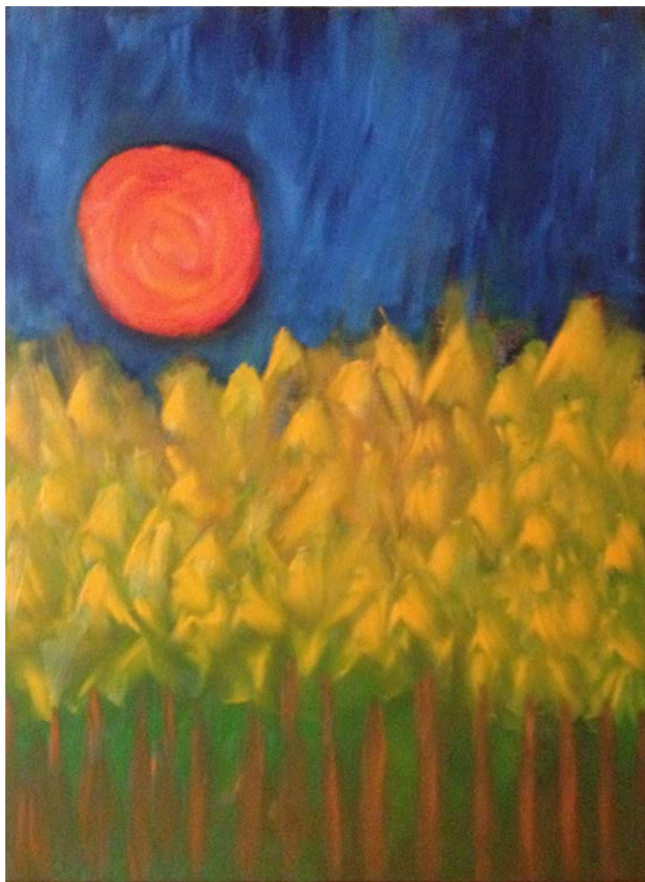
YELLOW FOREST 40" X 30" OIL ON CANVAS $2,000