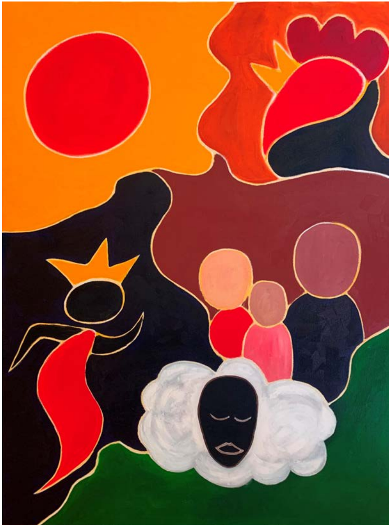
MULTI DREAMS 48" X 36" OIL ON CANVAS $2,000