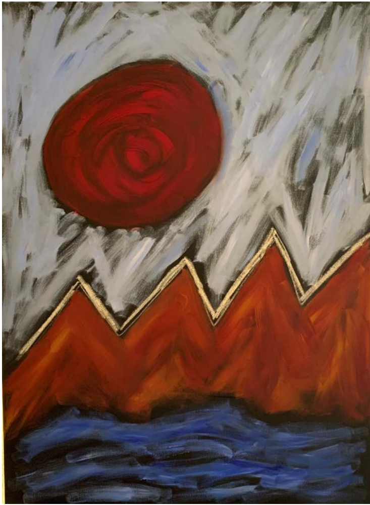
WINTER 40" X 30" OIL ON CANVAS $2,500