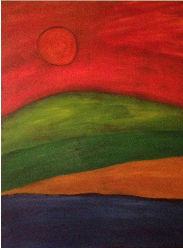
SUNSET BEACH 48" X 36" OIL ON CANVAS $2,000