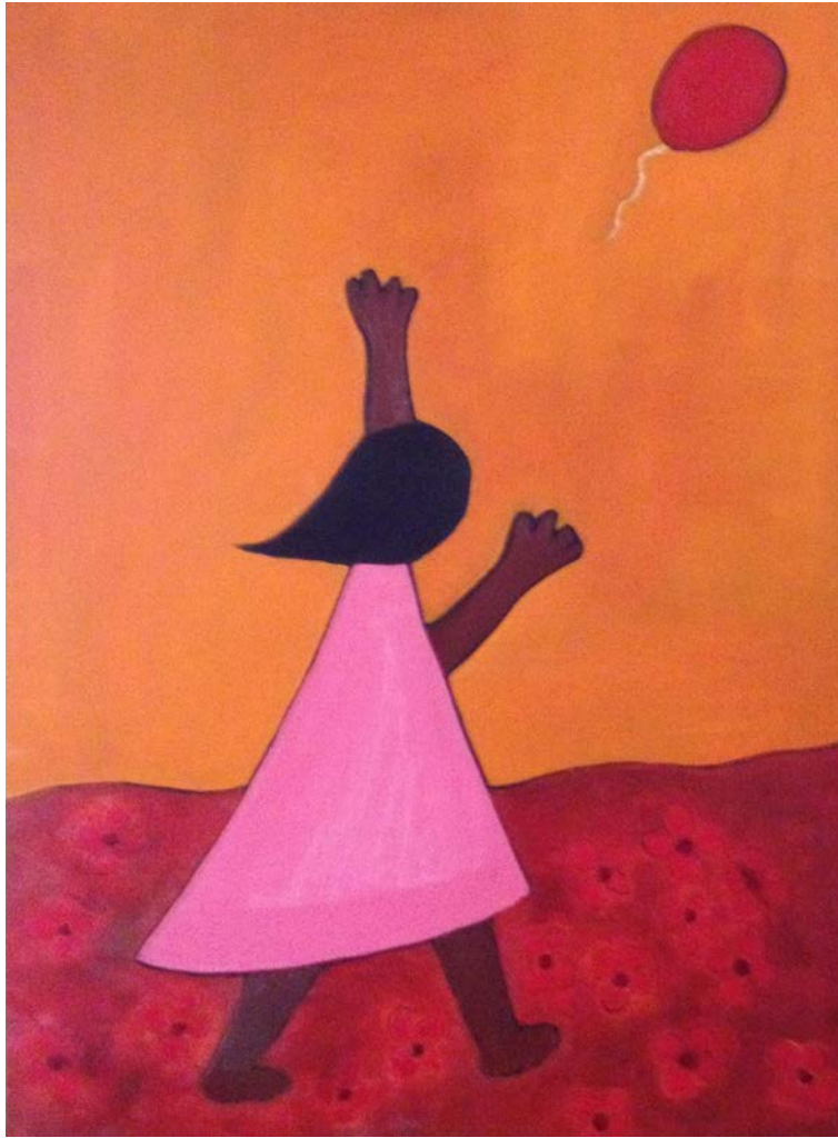
OOPS! 48" X 36" OIL ON CANVAS $2,000