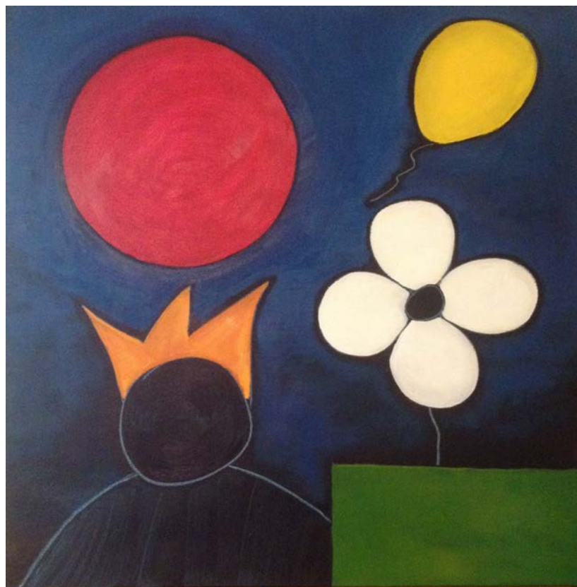
HIPSTER 36" X 36" OIL ON CANVAS $2,000